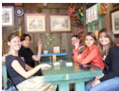
Other volunteers involved at Žene Ženama

As for Žene Ženama, it is my opinion that the organization may benefit more greatly if it can provide specific assignments for interns and volunteers. I think that this would increase the likelihood that the organization receives an end product that it desires and can use.